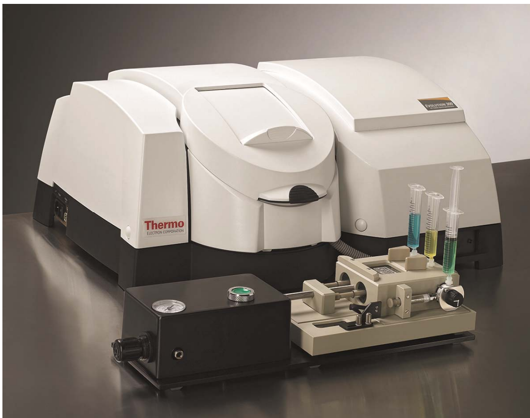
RX2000 interfaced with a Thermo Evolution 300 spectrometer