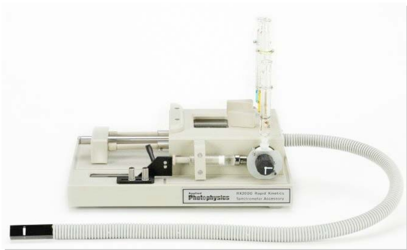
RX2000 Rapid Kinetics Accessory, with RX/DA Pneumatic Drive (shown in insert)

action the RX2000 mixes two reactants, fills a sample cell, stops the flow and simultaneously provides an output trigger. The dual pathlength micro-volume cell employs the latest silica fusion technology to give the highest possible optical efficiency and specification. All crucial sample flow circuit surfaces are biocompatible and chemically inert.