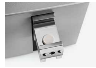
\rightarrow Quick-change tongue, flat

\rightarrow Testing of virtually all tablet shapes and sizes with the MultiTest 50