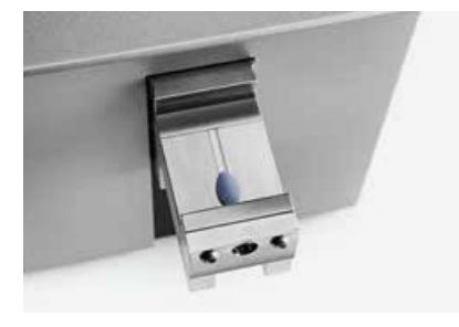
\rightarrow Quick-change tongue, with groove